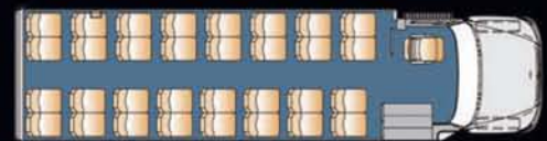
32 Passenger Plus Driver