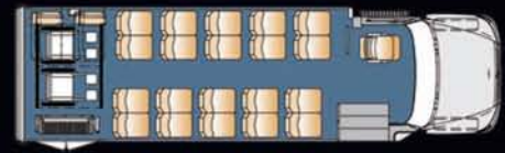
20 Passenger Plus 2 Wheelchair 4 Passenger Foldaway Seats Plus Driver