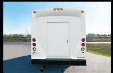
Stylish fiberglass rear cap with rear luggage access door