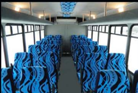
Spacious interior with high-back seats and overhead luggage racks