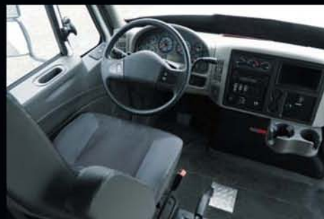
Conveniently located switches and easily-accessible driver's area with standard air suspension driver's seat