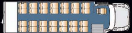
28 Passenger with Rear Luggage Plus Driver