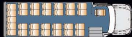
29 Passenger Plus Driver