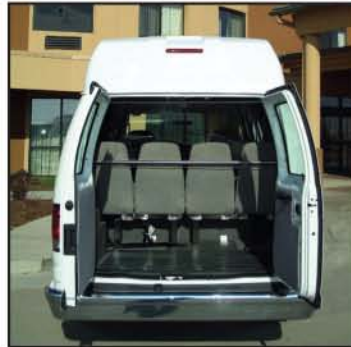
The Express' spacious rear luggage compartment can take over-sized luggage & packages.