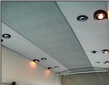
Interior headliner features high intensity reading lights & individual manual air vents

(Note: This is only a partial listing of optional equipment. For more complete information, contact your ElDorado National representative.)