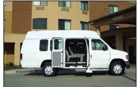
Convenient contoured ambulatory entry step at side cargo door