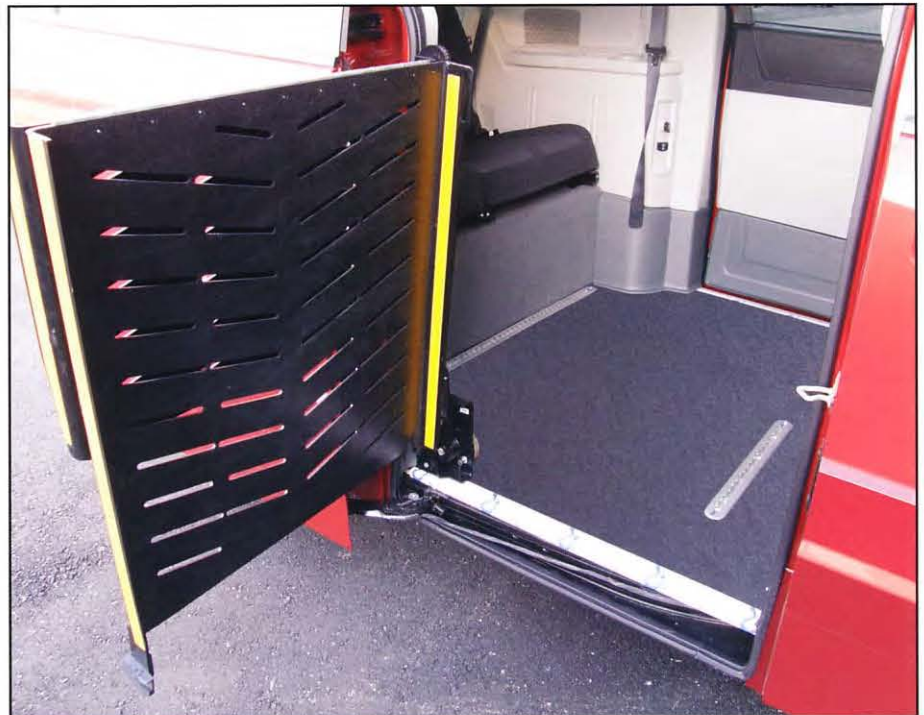
Fold down rear seat with spacious cargo room

Amerivan PT features durable vinyl flooring and multiple Q'Straint L-track tie-down locations. Amerivan PT also includes "Quick Release" removable front passenger seating, optional fold-down middle seat and enhanced rear seat capacity for optimum passenger load. Our sturdy manual fold-out ramp has an easy-to-use swing-out gate feature for quick and clear access for all your passengers.