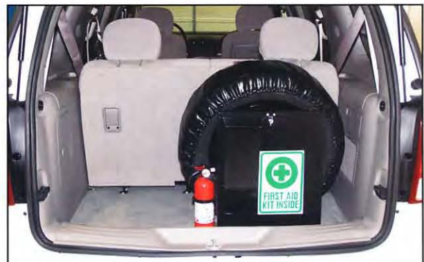
Optional DOT kit