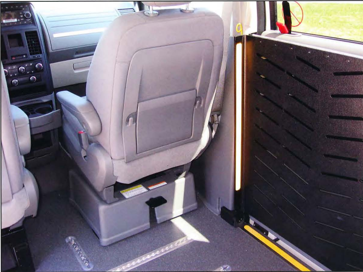
Ramp in position from the interior & removable seat

Amerivan PT features durable vinyl flooring and multiple Q'Straint L-track tie-down locations. Amerivan PT also includes "Quick Release" removable front passenger seating, optional fold-down middle seat and enhanced rear seat capacity for optimum passenger load. Our sturdy manual fold-out ramp has an easy-to-use swing-out gate feature for quick and clear access for all your passengers.